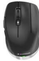
CadMouse Compact Wireless