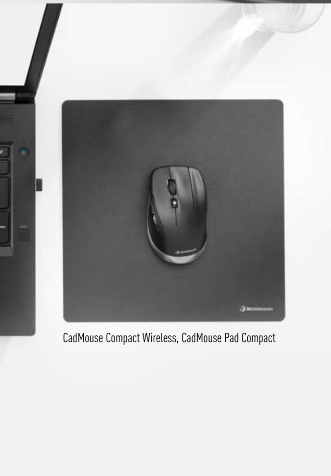
CadMouse Compact Wireless, CadMouse Pad Compact

Dedicated Middle Mouse Button – the days of clicking the mouse wheel are over thanks to the CadMouse's intelligent ergonomic design.