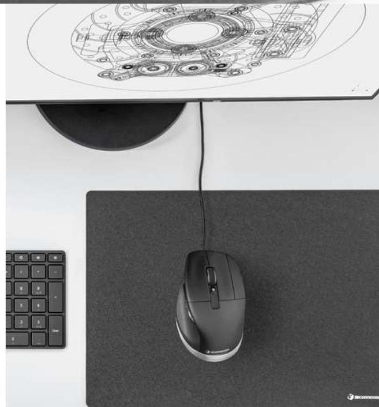
CadMouse Pro, CadMouse Pad

See website or contact us for details of supported applications.