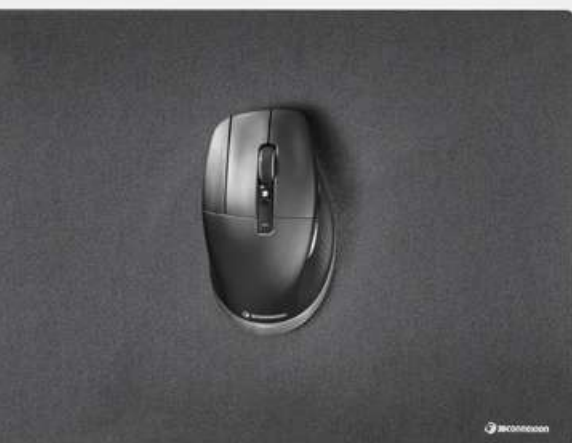
CadMouse Pro Wireless Left, CadMouse Pad

Left-side solution also available: CadMouse Pro Wireless Left