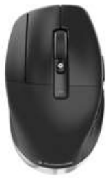
CadMouse Pro Wireless Left